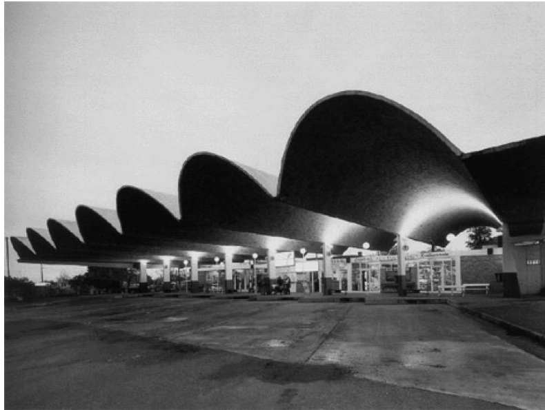
Eladio Dieste Salto Bus Terminal

Inverted forms of pure tension, in the Earth's gravitational field, have been employed as compression shells, providing shelter with minimal material expenditure. Pioneers in this method include Antoni Gaudi, Eladio Dieste, and Felix Candela.