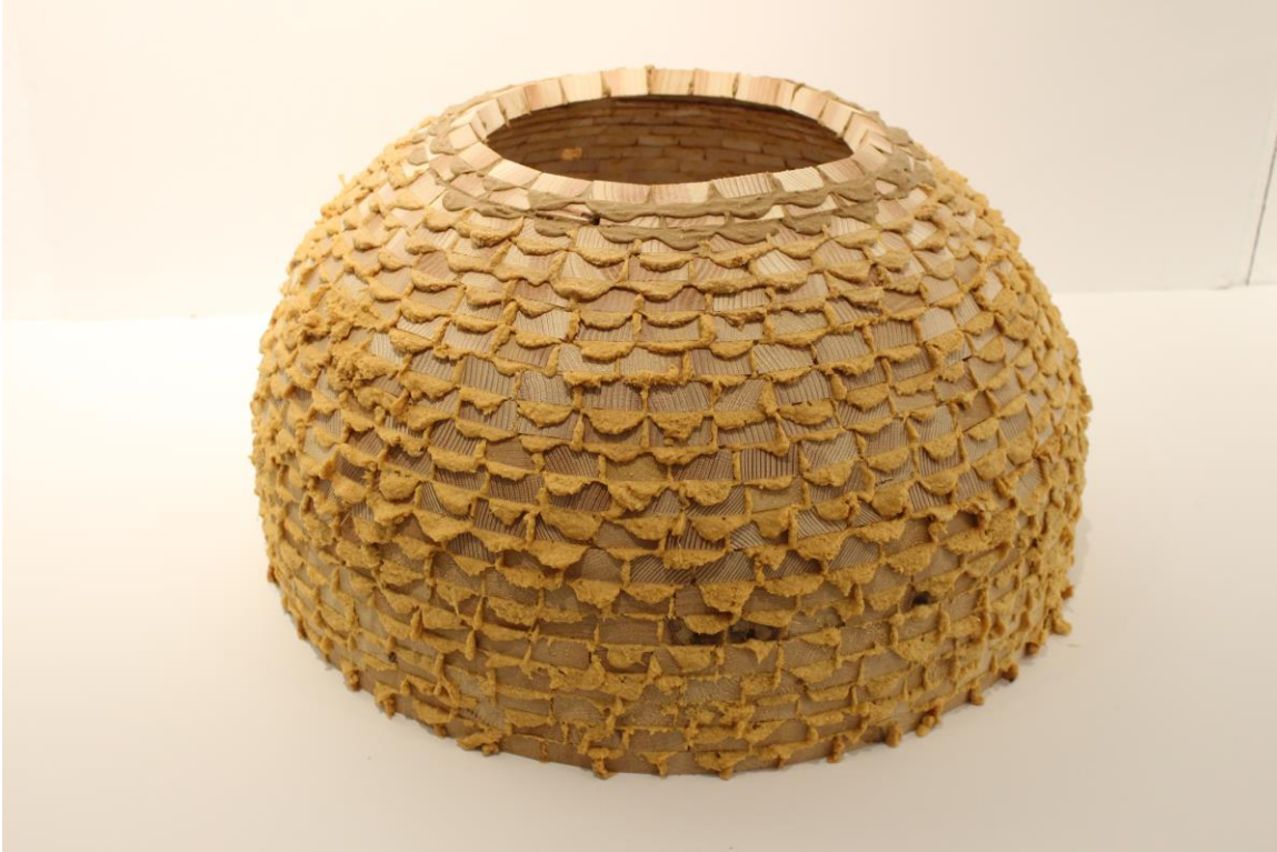
Minjae Kim, Radius Tool Dome, Fall 2017

This tactile knowledge will then be used to produce shell, or other types of structures that, when combined, create shelter at model scale. End conditions will be pre-determined and fixed, allowing stable beginning points for the semester projects. It is envisioned that the primary modeling techniques shall be casting techniques, although all other methods for shell construction can be considered.