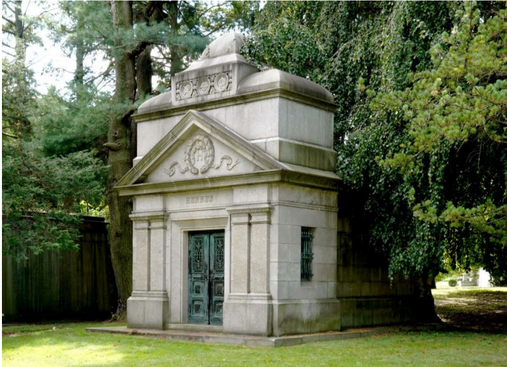
Figure 1: The Hennen Mausoleum