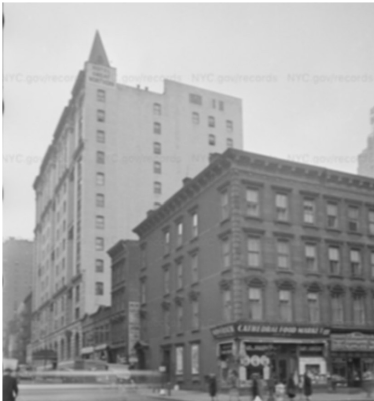
Figure 2: 103 West 56th Street (the row house on the left) on 1940 Tax Photo