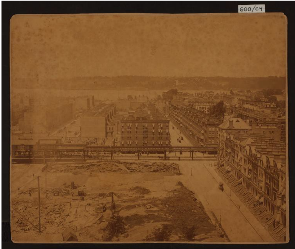
Figure 3: West 73rd Street in 1885