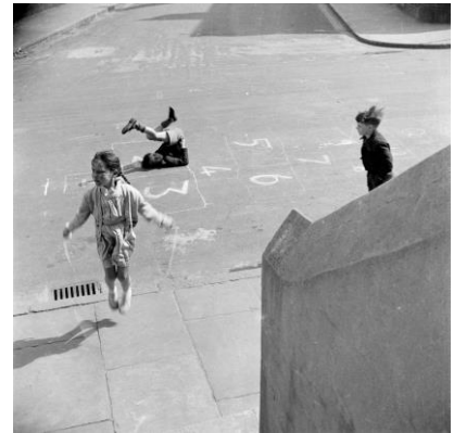
Nigel Henderson - Children Playing on Chisenhale Road c1949

For children, however, play is something more serious. Play is the primary means by which children learn and discover their place in the world. Designing specifically for play means recreating aspects of the world that children can both experience and be actively engaged in changing. A good play space is a microcosm of the world itself, providing and combining many different types of spaces, materials, ages, surfaces and equipment.