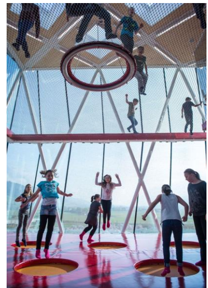
Snohetta - Swarovski Kristallwelten, 2015