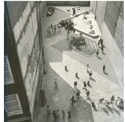
Aldo van Eyck, playground in Amsterdam void left by WWII