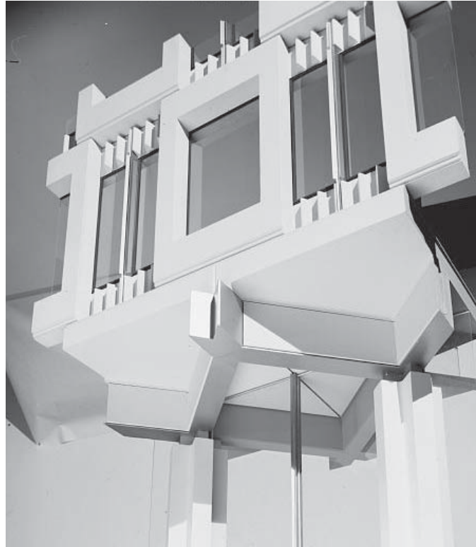
US Embassy, London

The task of the Studio will be to propose alternative uses for the Saarinen Embassy that consider the multitude of issues that it exposes: the evolving role of diplomatic presence, issues of security and surveillance, the projection of values that an architectural artifact embodies. The building has been purchased by the State of Qatar, and we will plan for an expansion of the building by fifty percent. What is the new recombinant role of this building in the civic life of multi-cultural London? One related to the post-war history of the progressive English social politics —a Public Library as the new Civic Center, a National Health Service Center, an Arab Institute to address new local and global relations?