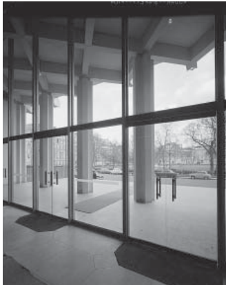
US Embassy, London