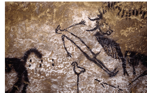
B Lascaux Cave Paintings, estimated 17,300 years old

To our mind, this thought has two aspects. In the first place it was a view pertaining to the priest—it was the terror of the ecclesiastic before a new force—printing. It was the servant of the dim sanctuary scared and dazzled by the light that streamed from Gutenberg's press. It was the pulpit and the manuscript, the spoken and the written word quailing before the printed word—something of the stupefaction of the sparrow at beholding the Heavenly Host spread their six million wings. It was the cry of the prophet who already hears the far-off roar and tumult of emancipated humanity; who, gazing into the future, sees intelligence sapping the foundations of faith, opinion dethroning belief, the world shaking off the yoke of Rome; the prognostication of the philosopher who sees human thought volatilized by the press, evaporating out to the theocratic receiver; the terror of the besieged soldier gazing at the steel battering-ram and saying to himself, "The citadel must fall." It signified that one great power was to supplant another great power. It meant, The Printing-Press will destroy the Church.