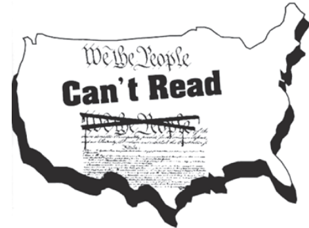
A The Triumph of Illusion and Spectacle: the Rise of Illiteracy in America

Excerpt Victor Marie Hugo's Notre Dame de Paris :