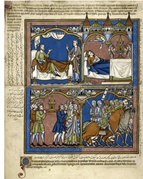
D The Crusader Bible, The picture book, which was likely made in Paris about 1250, has long been associated with the court of Louis IX, the pious crusader king of France and builder of the Sainte-Chapelle.

Six painters participated in the illumination of the Gothic Crusader Bible. Their miniatures are not only different in style but also in terms of colouring. A very clear difference is discernible in the rich use of gold. The original binding was lost during the centuries. However, the Bodleian Library in Oxford still possesses a manuscript which King Louis IX commissioned around the same time as the Crusader Bible and which still is in its original Gothic de luxe leather binding. That binding was used as a model for this fine art facsimile edition. 7