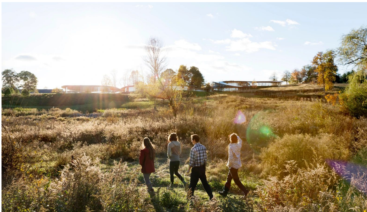
Grace Farms, Connecticut