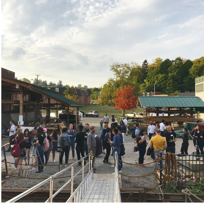
Hudson Valley Initiative, Barge Meet, Kingston, 2017