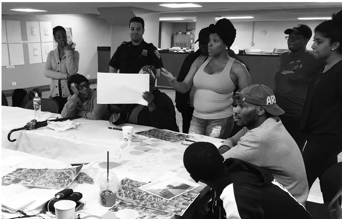
Community Design Fellow Meeting with East Harlem residents, 2018

Engagements with local stakeholders offer valuable insights and knowledge into the lived experience of a place and its context. It is our obligation to recognize the value of this kind of expertise and not “take” time and knowledge from these groups but instead offer something in return.