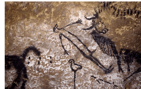
B Lascaux Cave Paintings, estimated 17,300 years old

To our mind, this thought has two aspects. In the first place it was a view pertaining to the priest—it was the terror of the ecclesiastic before a new force—printing. It was the servant of the dim sanctuary scared and dazzled by the light that streamed from Gutenberg's press. It was the pulpit and the manuscript, the spoken and the written word quailing before the printed word—something of the stupefaction of the sparrow at beholding the Heavenly Host spread their six million wings. It was the cry of the prophet who already hears the far-off roar and tumult of emancipated humanity; who, gazing into the future, sees intelligence sapping the foundations of faith, opinion dethroning belief, the world shaking off the yoke of Rome; the prognostication of the philosopher who sees human thought volatilized by the press, evaporating out to the theocratic receiver; the terror of the besieged soldier gazing at the steel battering-ram and saying to himself, "The citadel must fall." It signified that one great power was to supplant another great power. It meant, The Printing-Press will destroy the Church.