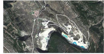
Poveda de la Sierra's mine