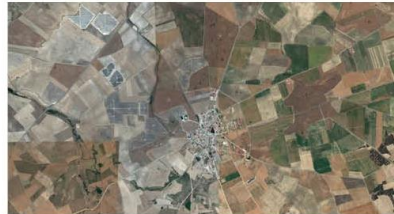
Langas's solar park