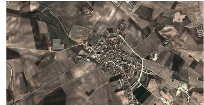
Fontiveros's solar park