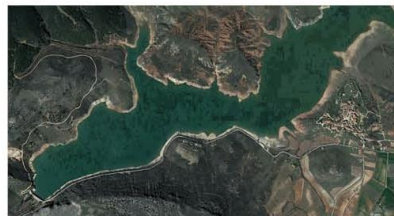
Pálmaces de Jádraque's dam