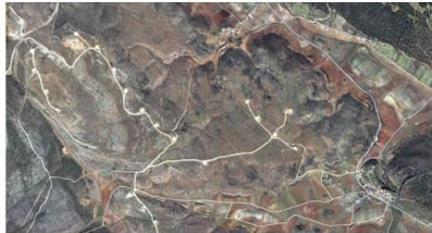
Anquela del Ducado's wind park