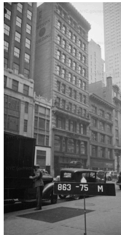
Figure 7 - 8 East 34th St. New York, NY