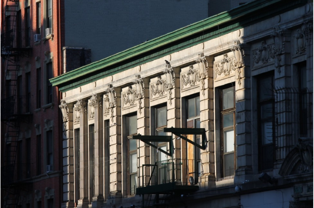
Figure 11 - A glance of the classical detailing of the upper floor of the Bernheimer Building.