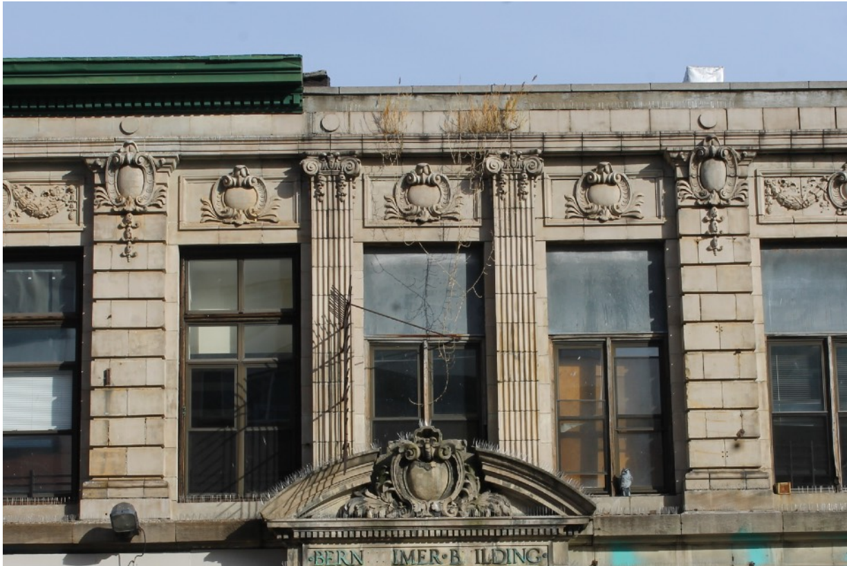
Figure 13 - Missing cornice, subsequent staining and plant growth.

and feature Ionic capitals. The spandrels above every second level window are adorned with cartouches and festoons. More cartouches abound on the capitals of the rusticated pilasters. This terra cotta has sporadic penetrations and cracks (Fig 12). From the western edge of the