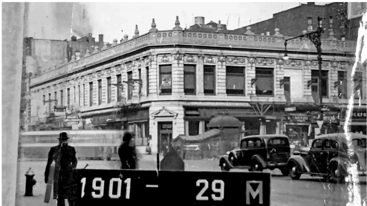
Figure 8 - 1940 Tax Photo showing the original southern portico with its broken triangular pediment.

buildings in the immediate area. According to the Real Estate Record and Builder's Guide of 1906, the Bernheimer brothers consulted Townsend, Steinle and Haskell Architects to design their new building which was constructed during this year for a cost of one-hundred thousand dollars. 13 Townsend, Steinle and Haskell frequently designed hotels and apartment buildings in the New York City area (Figs. 5, 6 & 7). The Office for Metropolitan History reveals that one of their most noteworthy projects was the Beaux Arts style Kenilworth Apartments at 151 Central Park West. The Bernheimer project was relatively small in budget and in scale