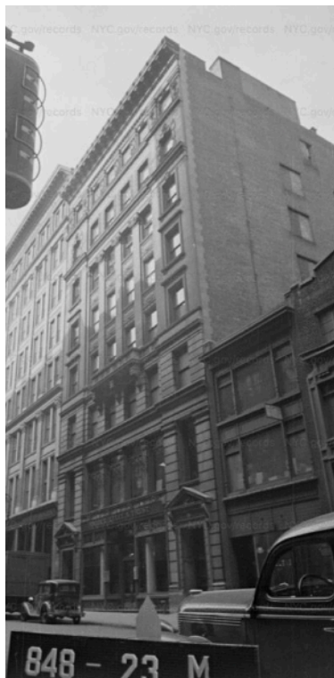
Figure 5 - 29 East 19th St. New York, NY

According to the New York Times, the plot of land for the Bernheimer building was purchased by Simon and Max Bernheimer for $94,000 in 1905. It also notes how this property was adjacent to another plot of land the brothers already owned. 12 Combined, this made for a lot that was 100 by 200 feet in size, large in comparison to the footprints of