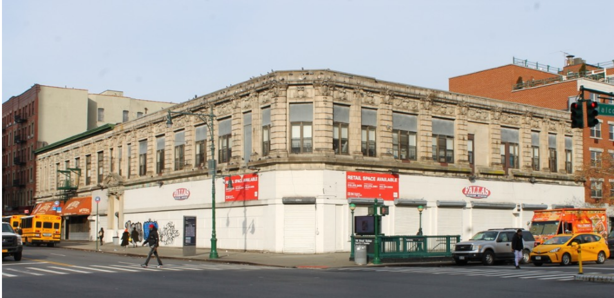
Figure 10 - The building in December of 2021.

In examining the facade today, one can notice a myriad of similarities and differences with its 1940 appearance (Fig. 10). The aforementioned extant portico appears to be made of cast-stone, as its denticulated trim has begun to crumble from underneath. To the frieze of this portico are attached bronze or copper letters stating “Bernheimer Building”. These letters have developed a rich verdigris patina, but a few of them are missing. The Malcolm X Boulevard facade is similar to its West 116th Street facade in that the second story is far more intact from the 1906 design than its ground-level counterpart. This facade is divided into nine structural bays. The greater portion of the street level appears to have been clad with some sort of cementitious material, with a concrete stringcourse at about eight feet from the sidewalk to support awnings. Dotted the Malcolm X Boulevard facade are a series of small metal roll-up doors. A street entrance can be seen at the north end of this facade. Amy Ruth’s Homestyle Southern Cuisine occupies about a third of the West 116th ground level facade, breaking up the monotony of the otherwise plain ground level.