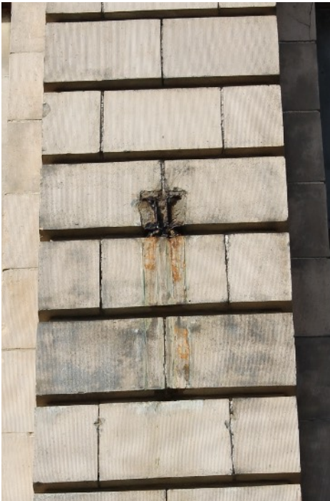
Figure 12

The classical facade of the upper stories is clad with what appears to be terra cotta, glazed to resemble limestone (Fig. 11). Records from the New York Architectural Terra Cotta Company reveal that Townsend, Steinle and Haskell architects commonly specified terra cotta facades with glazing treatments to resemble limestone. The pilasters of this second level are done in such a way that gives them a likeness to rusticated stone. Intermediate pilasters at each end of the building and above the classical portico are fluted