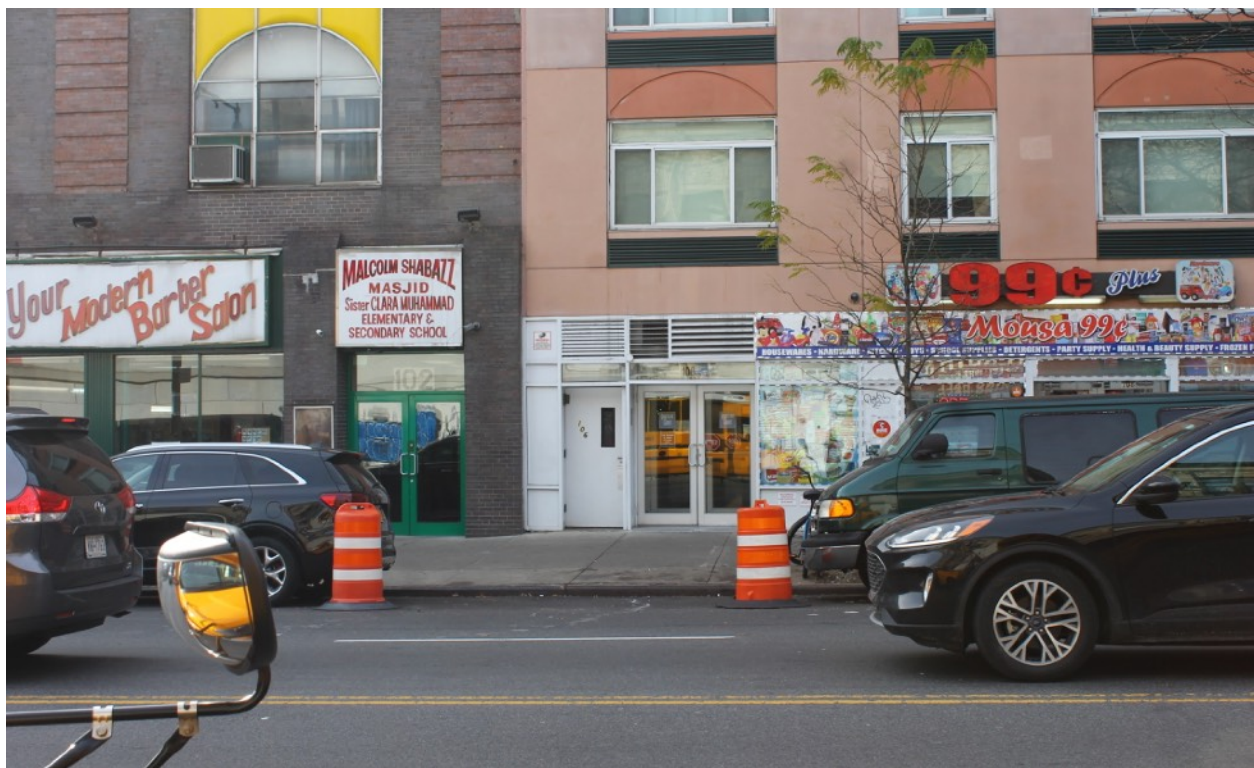
Figure 15 - Storefronts opposing the Bernheimer Building's West 116th Street facade.

Overall, the building today fortunately still boasts a portion of its original classical detailing and fabric. While these features endure, the building has lost some of the visual presence and capacity to engage with its community in its loss of the storefront facades. Not only does this current ground-level facade stand in contrast with the 1906 facade of the second story, it also contradicts the nature of its entire surroundings, which are otherwise filled with enticing storefronts (Figs. 15 & 16). The bustling activity observed at neighboring businesses which use transparent storefronts is a testament to the value with which the neighborhood views them. Further, Amy Ruth's Restaurant located in the Bernheimer building