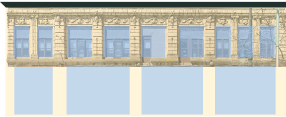
Figure 17 - Elevations showing glass storefronts and cornice reinstated in the building's facade.

reinstated in order to rectify the building's visual unity and to protect the century-old terra cotta facade below (Fig. 17).