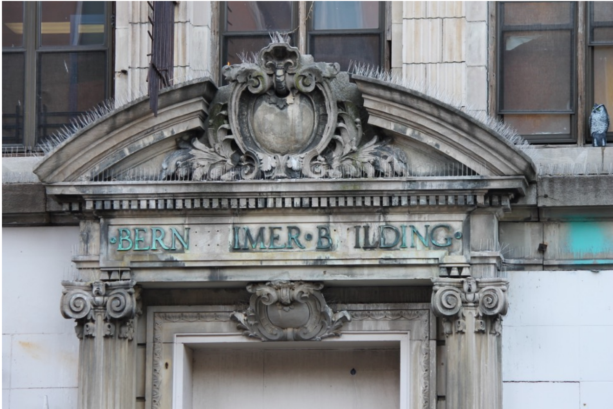
Figure 9 - The surviving cast stone portico at the West 116th Street entrance.

A 1940 tax photograph reveals what appears to be the building's original facade (Fig. 8) The image shows a classical facade, bipartite in composition both on the West 116th Street and Lenox Avenue facades. The principle facade on West 116th Street and in the left hand of the 1940 image is divided into 18 bays. At the center bay on the ground level of this facade is a portico with a pediment broken by a cartouche which is still extant (Fig. 9). Of note at the center of the 1940 image and on the chamfered corner of the building flanked by the West 116th Street and Lenox Avenue facades is another classical portico, triangular in shape marking the entrance to a tenant space. This pediment has since been lost, and is no longer visible on the facade. In comparing additional 1940 tax photographs with contemporary observations, the upper stories of the building appear relatively intact in comparison to the ground-level street facades.