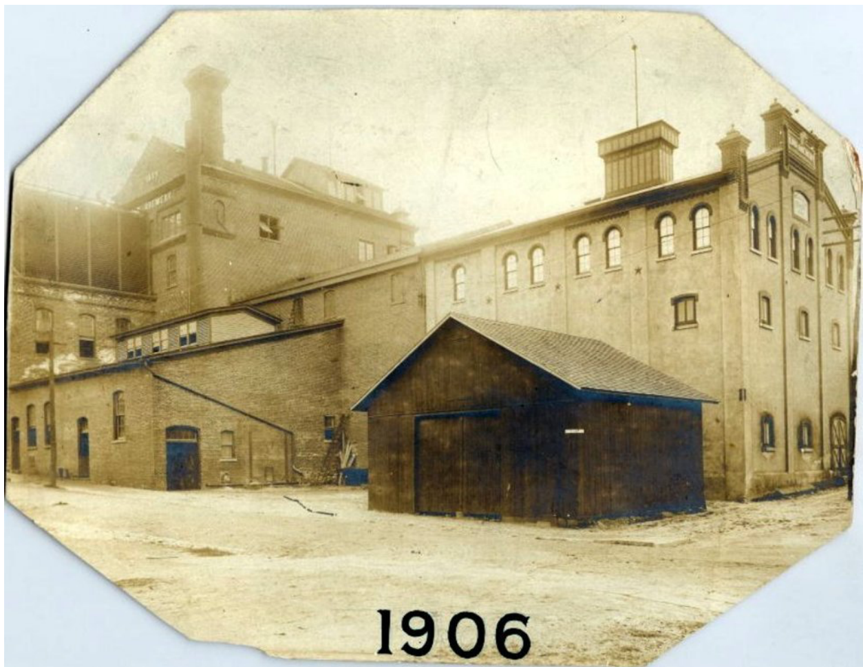
Figure 1 - The Lion Brewery at Columbus Ave. and 108th St.