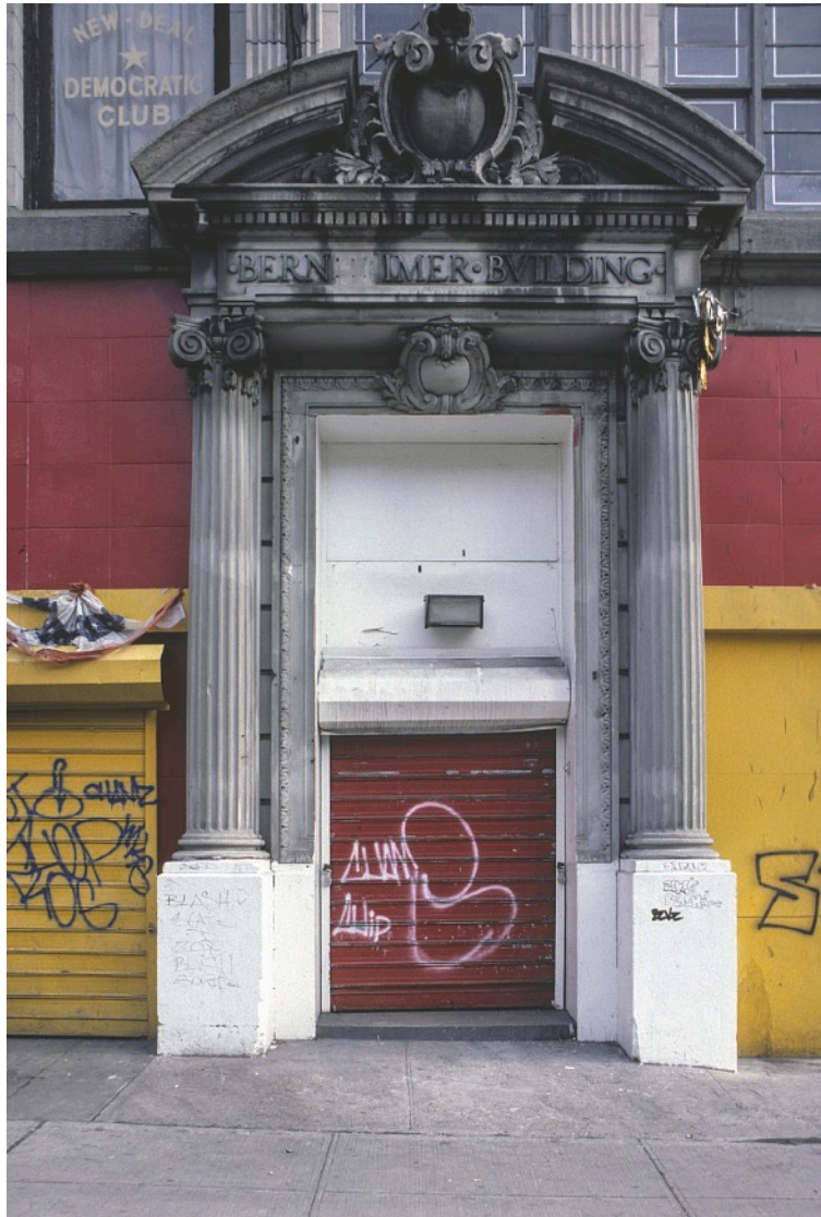
Circa 1986.