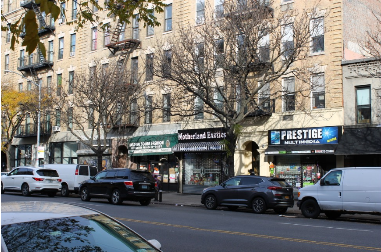
Figure 16 - Storefronts on the west end of the Bernheimer Building's Block.

itself has been a locally-owned business since 1998, shows the potential for a more community-engaged storefront environment. In order to foster potential organizations and/or businesses that could serve residents in the immediate area, an intervention to reinstate some of the transparency of the Bernheimer Building's ground level is therefore proposed.