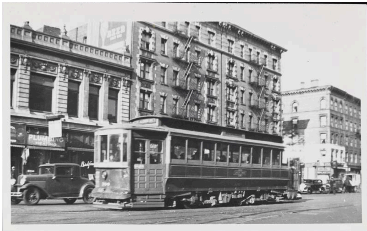
Figure 4 - A streetcar with the Bernheimer Building at left. Bickford's delicate signage can be made out to the immediate left of the streetcar.

A 1921 New York Times advertisement names the “Victoria School for Dancing”, in the Bernheimer Building. It offered a series of eight dance lessons for a total of ten dollars. 8 Bickfords Restaurant chain was at one time located here, evident in an image sourced from the Museum of the City of New York. Samuel Longley Bickford established his restaurant