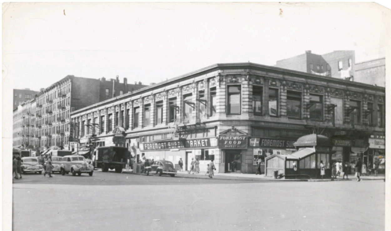
Figure 14 - A photo taken from roughly 1948 showing the removed parapet of the building.

and Phenix National Bank located in one of the dozen small stores in the ground floor of the building.” 15 The extent of the fire damage is not known from this article, but it is evident in observing the building’s lobby today that interior renovations have been heavy-handed. Another substantial alteration to the building came with the occupation of the Woolworth department store in 1969. An alteration record from this year at the Municipal Archives states that the project “rehabilitated [the] first floor and basement.” 16 As described, the resulting alteration is pronounced in the context of the greater facade. It entailed the infilling of nearly all of the storefronts at the building’s ground level, which produced the facade seen today. This renovation also likely marks the point at which the missing triangular portico at the