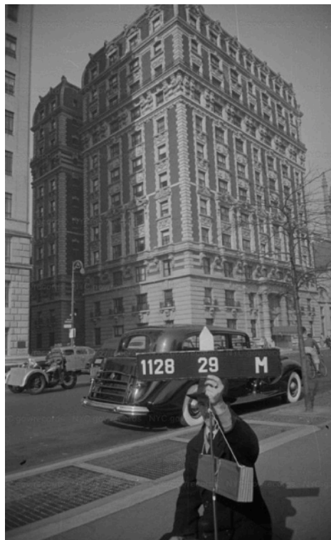
Figure 6 - Kenilworth Apartments, Central Park West, New York, NY