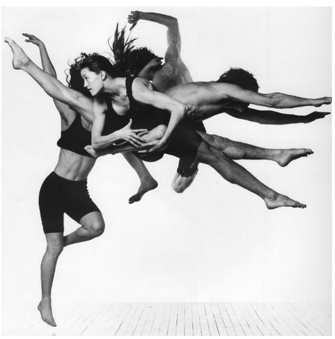
Lois Greenfield. Breaking Bounds. 1992