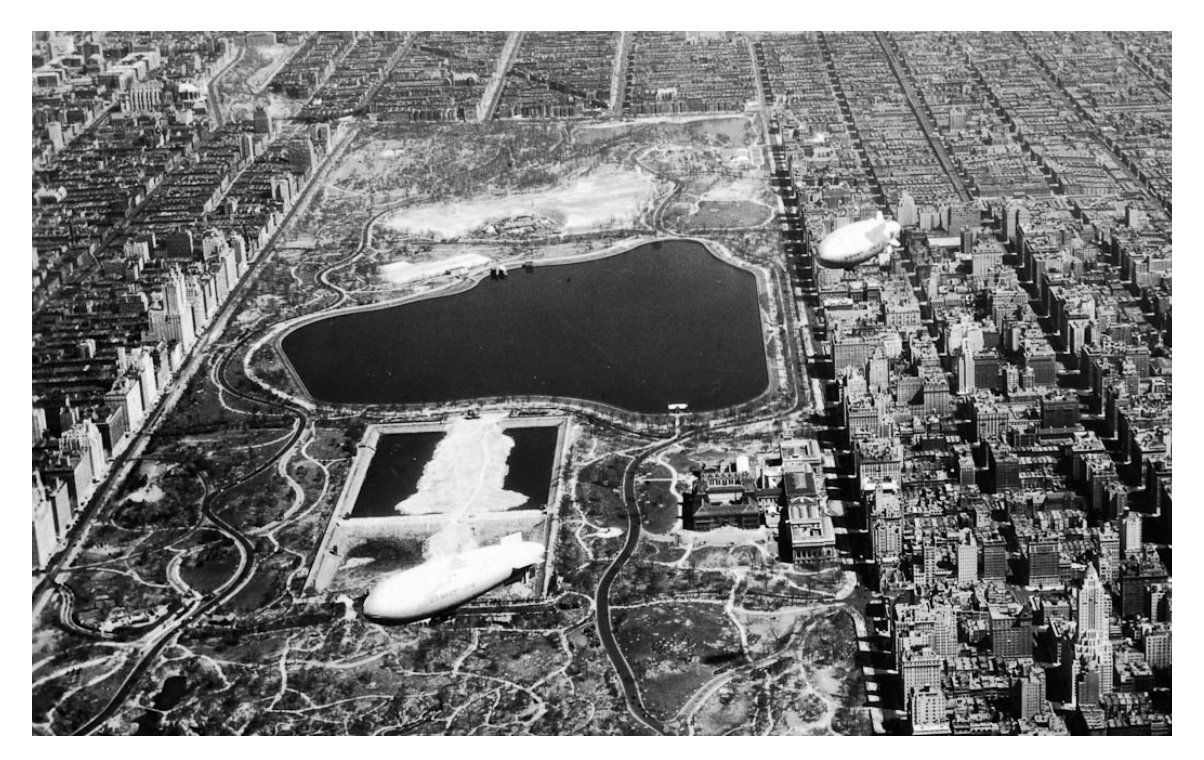
1931. Aerial view of Central Park, looking north from about East 72nd Street. A pair of dirigibles hovers above the park. The Lower Croton Reservoir is being filled in to make space for the Great Lawn. Among other material, stones from the building of Rockefeller Center are being used to fill in the obsolete 33-acre receiving reservoir, which held 180 million gallons of water piped in from the Croton River in Westchester.

ENGAGING TABOOS OF THE 21ST CENTURY METROPOLIS