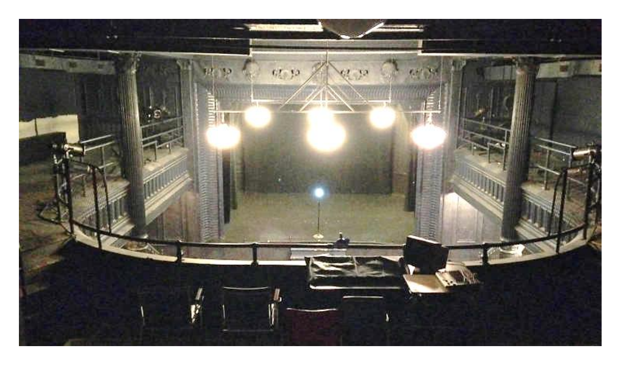
Epic Architecture. New York and Theatre

Un théâtre est d'abord un instrument avant d'être un bâtiment et éventuellement un monument urbain.