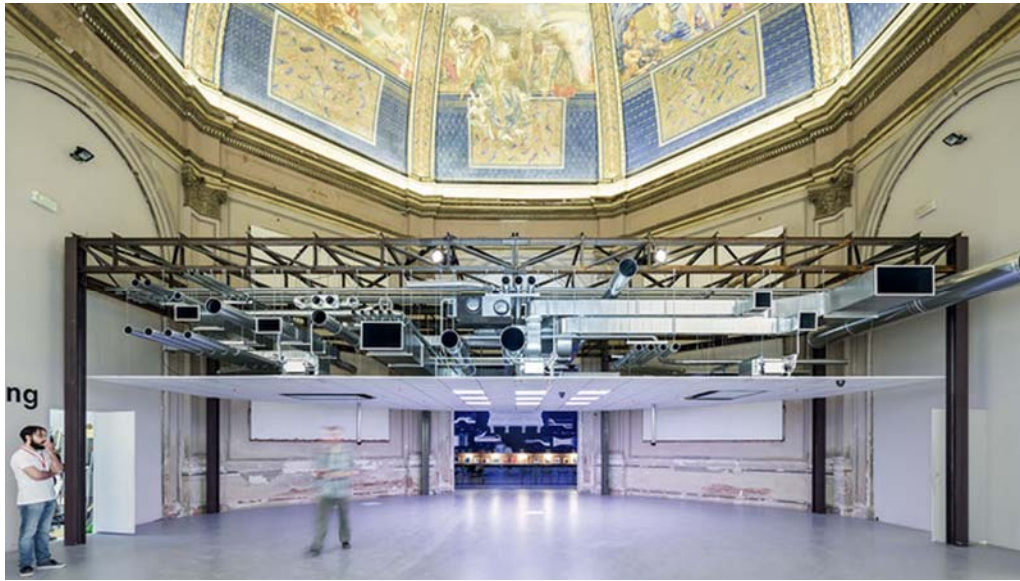
Ceiling, Elements of Architecture, Rem Koolhaas