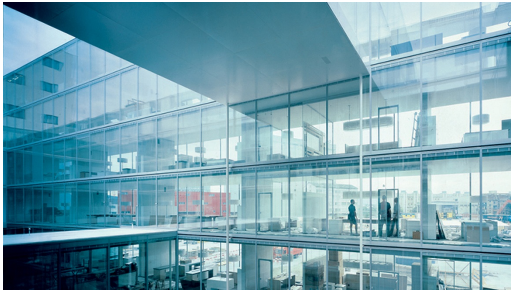
Novartis Office Building, SANAA

Already in process, the ceiling is in retreat. Innovations in glazing technology through better sealed frames, highly effective coatings and integrated shading devices are reducing air conditioning requirements and hence ductwork space requirements.