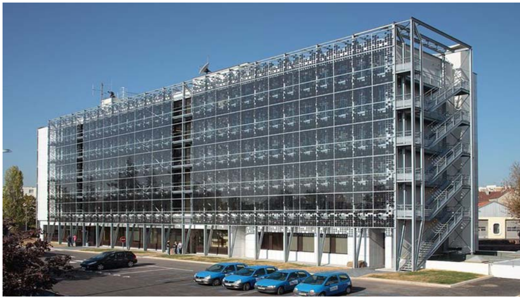
BDF Suez Office, Atelier Phileas

At the same time, façades are working harder. In addition to traditional functions of visual connection to the outside and solar & thermal regulation, the incorporation of photovoltaics, wind and other power generation apparatus are becoming more common.