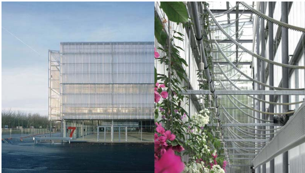
Exterior & Buffer, Lacation and Vassal, Fair & Exhibition Hall

Going further, new attitudes toward sustainability are creating renewed interest in measures such as natural ventilation in lieu of air conditioning. Double façades, once thought to represent the future of climate control in buildings, are giving way to occupiable buffer spaces. These spaces which form the building enclosure can hold micro climates capable of hosting program and greenery.