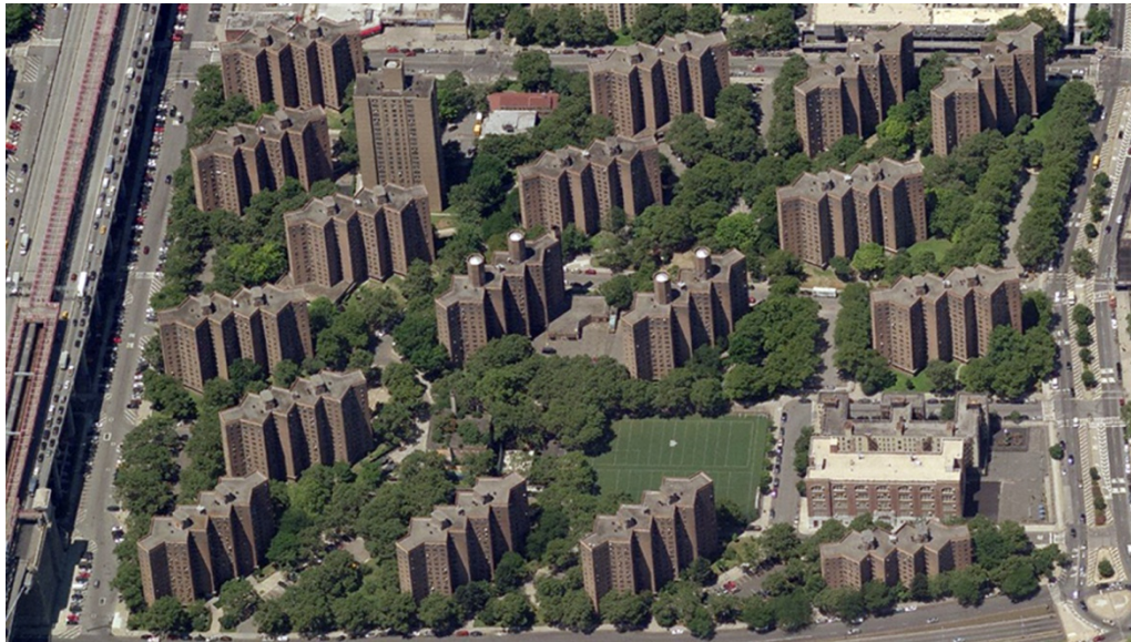
Baruch Houses, Emery Roth & Sons

The building site will be Baruch Houses on the Lower East Side of Manhattan. This 28 acre public housing development has 2,200 units housing over 5,000 people in almost three million square feet of building area. The studio will address the lack of programmatic diversity in the development. The injection of commercial programs will mirror the programmatic mix found elsewhere in the Lower East Side with the aim of reintegrating the development with it's surrounding district. Students will select a unique site on the development and construct a model of their building for insertion into a group model, among other representations of their work.