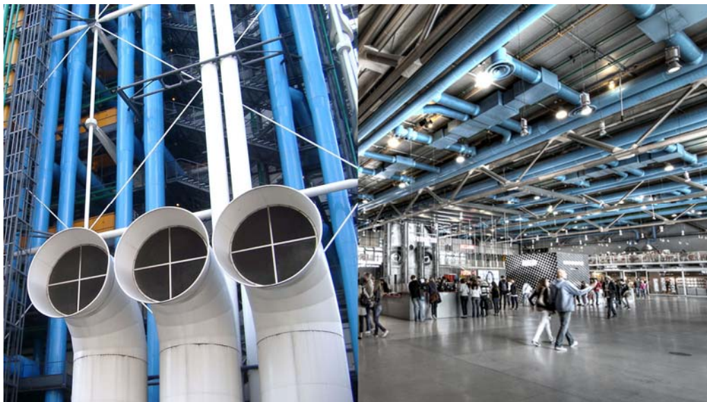
Exterior & Interior, Centre Georges Pompidou, Richard Rogers & Renzo Piano

From spaces without these services as in the time of Ledoux, to the dangling wire aesthetic of the early modernist period, services and the space they occupied continued to thicken. The dropped ceiling became the surface which separated occupiable space from service space which could amount to 50% of the building section. While attempts to extricate the interior of buildings from services have been made, 'pas de tubes' has not fully materialized.