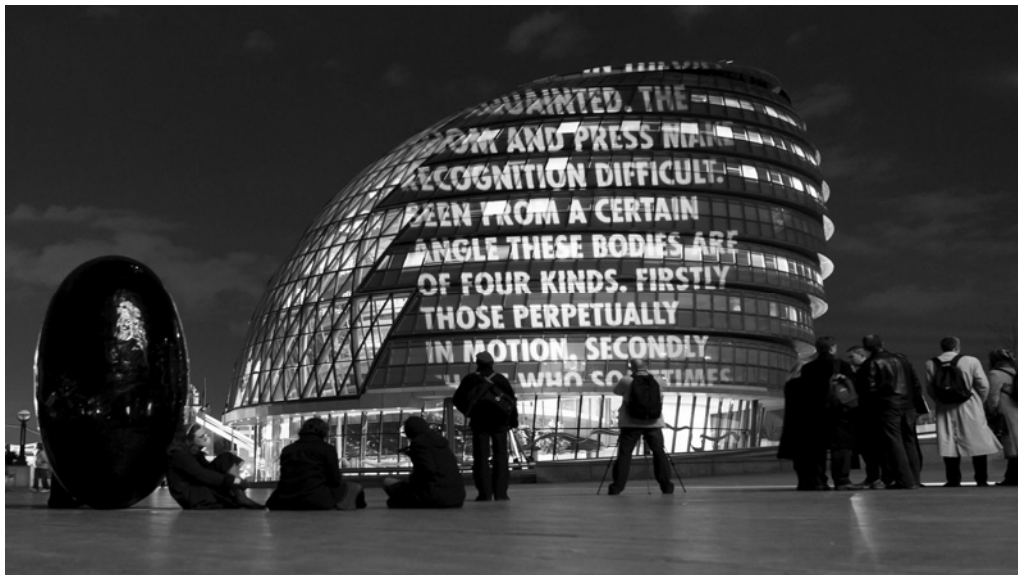
Jenny Holzer Projection on London City Hall, Foster + Partners

The program for the building will be a speculative commercial condominium. The vertical structure clad in the newly developed service wall will have clean and open interiors. Solar & thermal regulation, ventilation, power generation and electronic information display will be confined to the service wall. The building will strive to be a net zero consumer of energy. The open interiors will have the ability to accommodate office, retail, gallery, showroom or other functions, as the potential condominium buyer sees fit. The building diagram will be guided by interior comfort and energy use as mediated by the service walls to produce the unexpected in form.